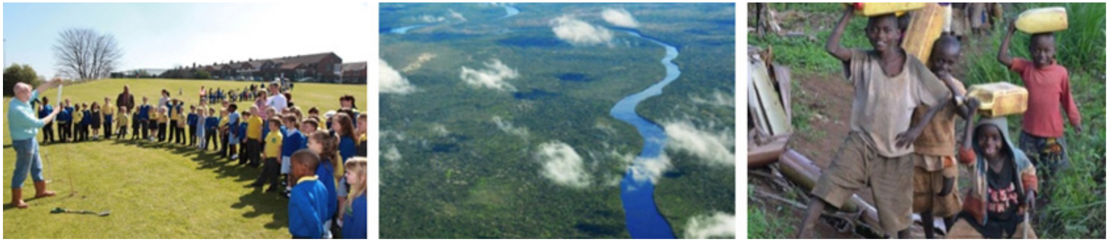
Sample Carbon Offsetting Projects - UK Schools Tree Planting - Amazon Avoided Deforestation, Brazil - Clean Water projects, Rwanda

The offsetting process is simple and straightforward - just visit www.carbonfootprint.com/carbonoffset.html and type in your CO 2 tonnage (from the front page of this report) and this will show you the latest range of projects and their pricings. Certification is available to download online.